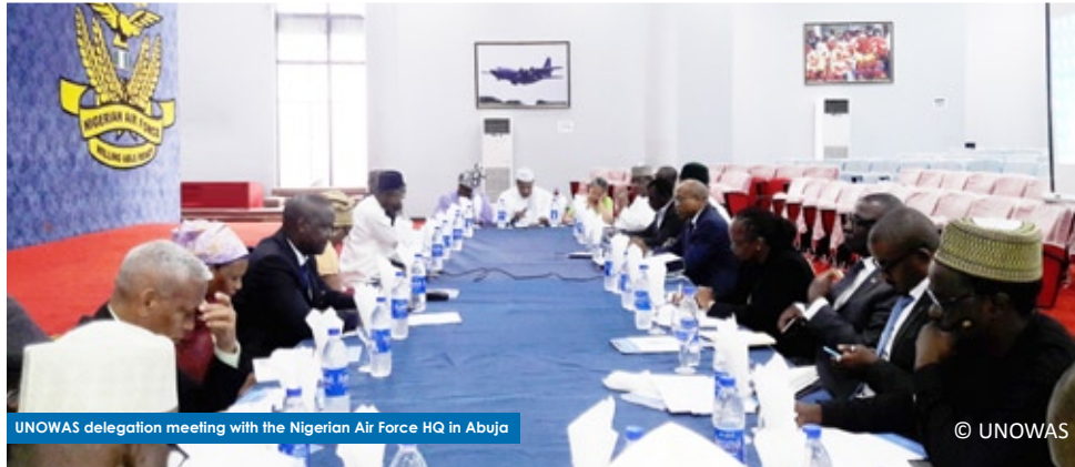
UNOWAS delegation meeting with the Nigerian Air Force HQ in Abuja

Since 2009, when the erstwhile leader of Boko Haram Mohammed Yusuf died in police custody, the level of killings and destruction, enslavement of girls and women, and the loss of livelihoods inflicted by the group has caught the world’s attention. In response, the United Nations has adopted an approach that attempts to bring together the organization’s vast experience... Read more P.3