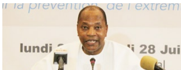
Mohamed Ibn Chambas: SRSg UNOWAS

«Over the past decade, efforts to prevent violent extremism were primarily designed as a complement to anti-terrorist operations. They often mainly resulted in short-term security measures aimed at containing the immediate consequences of violent acts and preventing their recurrence.»