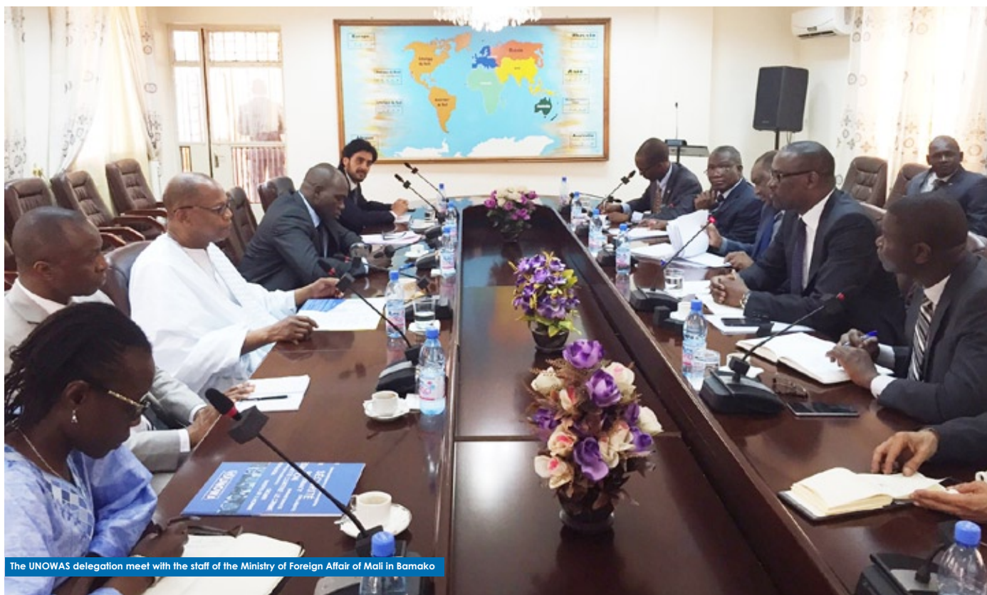
The UNOWAS delegation meet with the staff of the Ministry of Foreign Affair of Mali in Bamako

For his first visit to the G5 Sahel countries ( Burkina , Niger , Mali , Mauritania and Chad ) since the establishment of UNOWAS in January, the Special Representative of the UN Secretary-General in West Africa and the Sahel (UNOWAS), Mr Mohamed Ibn Chambas, called for a stronger partnership between the countries of G5 Sahel and the United Nations.