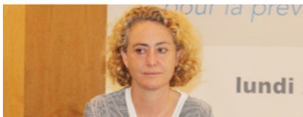
Dagmar Schmidt, Amb. Switzerland to Senegal

«Prevention requires that we work on the causes of violence, not just the symptoms. This often involves a paradigm and attitude shift – and more specifically it involves a willingness to accept plural societies and diverse identities, and to recognize the value of tolerance and dialogue.»