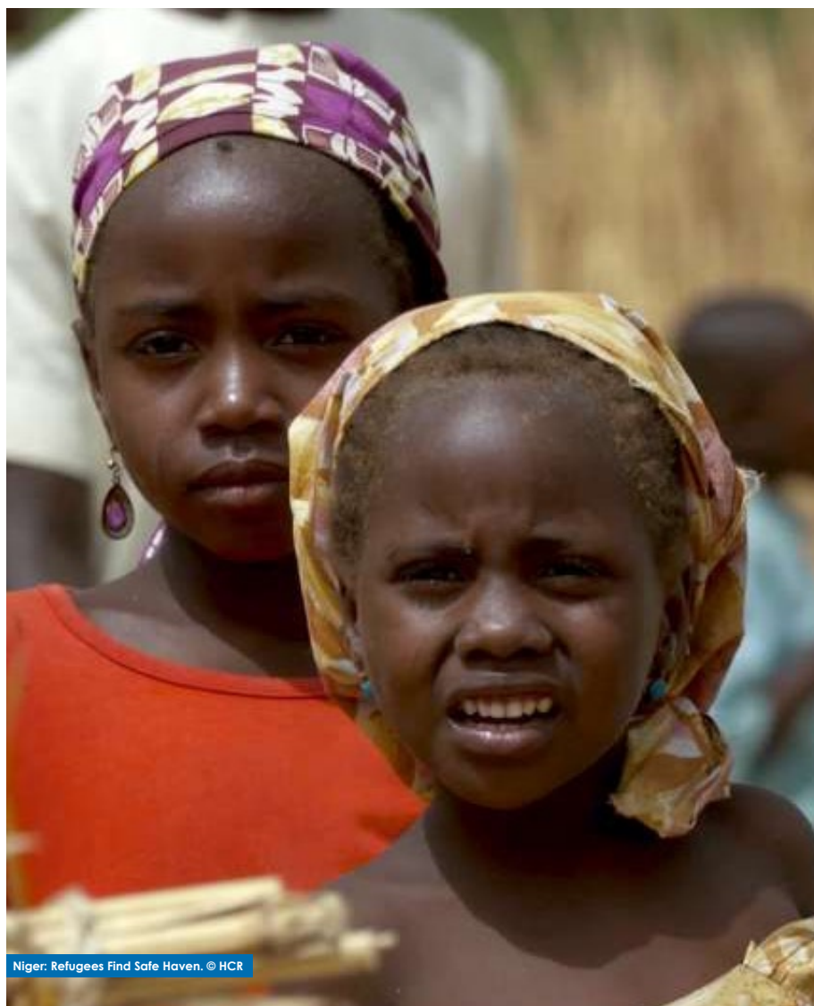
Niger: Refugees Find Safe Haven.

don't know how I am still alive. I was completely overwhelmed by what was happening around me. There were dead bodies of men, women, children around me. I spent the night without eating, without drinking. The insurgents who had remained by the river were finishing the survivors."