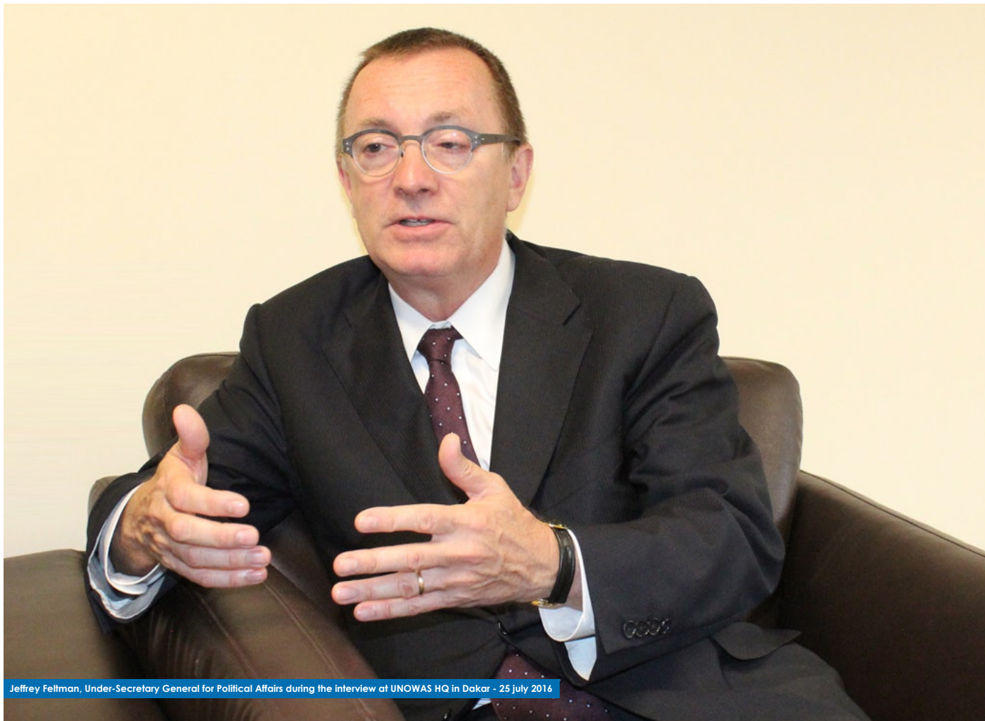
Jeffrey Feltman, Under-Secretary General for Political Affairs during the interview at UNOWAS HQ in Dakar - 25 July 2016

At the conclusion of his tour in Central and West Africa regions on 25 July, Mr. Jeffery Feltman, United Nations' Under-Secretary-General for Political Affairs spoke to UNOWAS E-Magazine in Dakar about the objectives of his visit and the role of UNOWAS in the region. Interview.