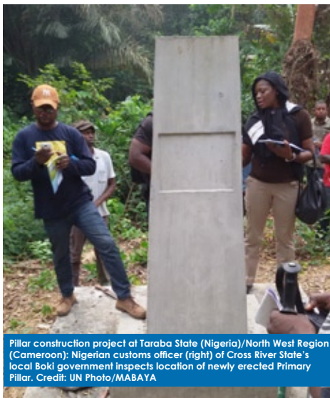
Pillar construction project at Taraba State (Nigeria)/North West Region (Cameroon): Nigerian customs officer (right) of Cross River State's local Boki government inspects location of newly erected Primary Pillar.

Under the leadership of the Chair of the Cameroon-Nigeria Mixed Commission (CNMC), Mr Mohamed Ibn Chambas, the two delegations met in Yaoundé, Cameroon on 6 June to discuss outstanding issues and decide on a roadmap to ensure a peaceful and final settlement of the demarcation of the land border between the two neighbors.