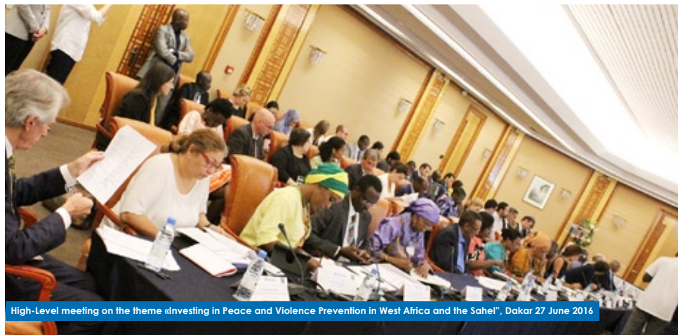
High-Level meeting on the theme «Investing in Peace and Violence Prevention in West Africa and the Sahel», Dakar 27 June 2016

A high-level meeting on the theme: «Investing in Peace and Violence Prevention in West Africa and the Sahel» was held in Dakar on 27 and 28 June 2016 to identify effective measures to prevent violence including violent extremism and to explore innovative approaches to invest more in peace... Read More P.3