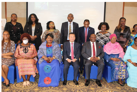
Special Envoy Huang Xia (Center, front row) with members of the Great Lakes Women Entrepreneurs network, Nairobi, Kenya, 2 December 2021

Women play a critical role in conflict prevention and resolution. "Where women lead, processes are more inclusive, address root causes and lead to more sustainable outcomes", reaffirmed the UN Deputy Secretary-General Amina Mohammed during a high-level retreat on peace, security and stability in Africa, held in November 2021 in Nairobi. Read more