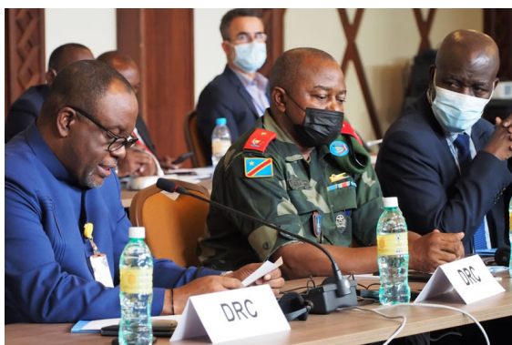
Participants at the experts' meeting on the implementation of the operational cell, Goma, DRC, 13-17 December 2021 (Photo: Elisa Lux/OSESG-GL).