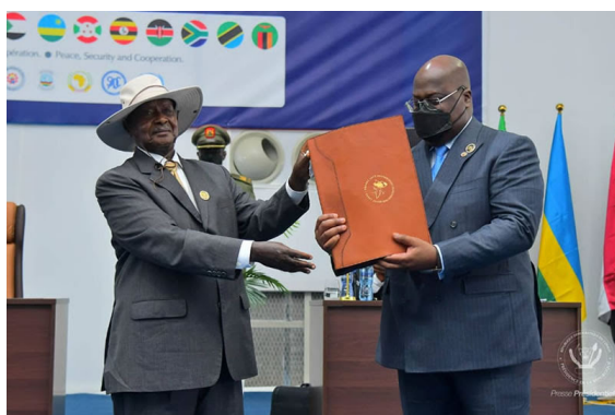
President Yoweri Museveni of Uganda (L) hands over chairmanship of the Regional Oversight Mechanism to President Felix Tshisekedi of the DRC.

I am pleased to share with you the fifth edition of our Newsletter. The Newsletter covers key events and developments for the Office of the Special Envoy for the Great Lakes region between September 2021 and April 2022. Among others, this Newsletter puts the spotlight on the conclusions of the 10th high-level meeting of the Regional Oversight Mechanism of the Peace, Security and Cooperation (PSC) Framework for the Democratic Republic of the Congo (DRC) and the region. The meeting took place on the shores of the Congo River in Kinshasa on 24 February of this year. In the area of security, the Newsletter features regional efforts to advance security cooperation, including the launch of consultations between the DRC Government and Congolese local armed groups, hosted by Kenyan President Uhuru Kenyatta in Nairobi in April, as well as progress made in the operationalization of the Contact and Coordination Group on non-military measures in complement to military operations against negative forces in the region. The Newsletter also covers my last two briefings to the United Nations (UN) Security Council, during which I emphasized the encouraging trends in dialogue, cooperation and integration in the Great Lakes region, which will need to be intensified and supported in order to address the ongoing security and humanitarian crises in eastern DRC.