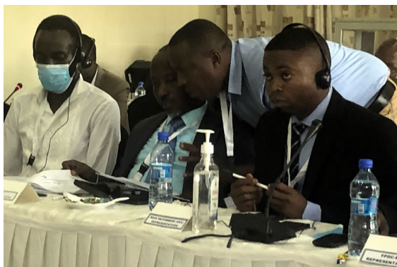
Members of armed groups delegations during the Nairobi talks on 27 April 2022.