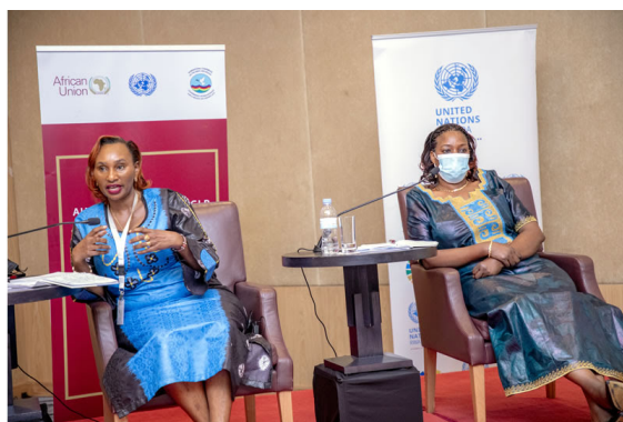
Women in the Great Lakes training on Mediation and Negotiation Skills, Kigali, Goma 6 September 2021