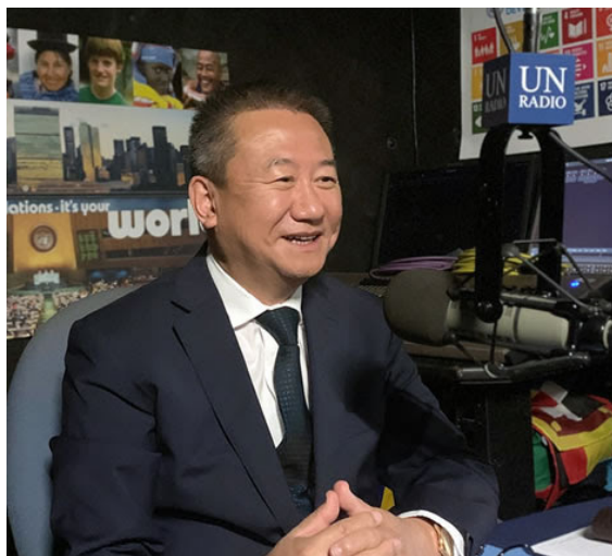
Huang Xia, UN Special Envoy for the Great Lakes region.