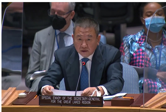
Special Envoy Huang Xia briefing the UN Security Council on 27 April 2022, New York (Photo: Penangini Toure/OSESG-GL).