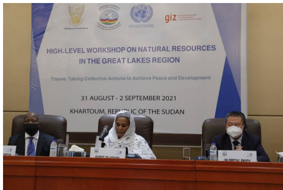
Participants at a workshop on natural resources in Khartoum, Sudan, 31 August 2021