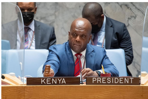
Kenya's Permanent Representative to the UN, Martin Kimani, presiding over the Security Council, 20 Oct. 2021

On 27 April 2022, the UN Security Council convened to discuss the situation in the Great Lakes region. Two topics dominated the discussion: the widespread insecurity and humanitarian crisis linked to the destabilizing activities of armed groups in eastern DRC, including the 23 March Movement (M23), the Allied Democratic Forces (ADF) and the Cooperative for the Development of the Congo (CODECO); and the intensification of regional diplomacy in the Great Lakes region, particularly through the Regional Heads of State Conclave meetings on the DRC on 8 and 21 April in Nairobi, which resulted in the adoption of a two-track, political and military, approach to put an end to the persistent threat posed by armed groups. Read more