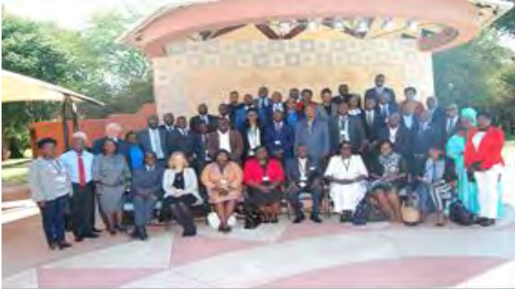
"Think Tanking" for the Great Lakes Region