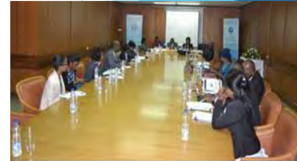
Participants at the Workshop on the Implementation of Laws and Policies on SGBV in Zambia, 6 th September 2017 Lusaka, Zambia.

"Think Tanking" for the Great Lakes Region