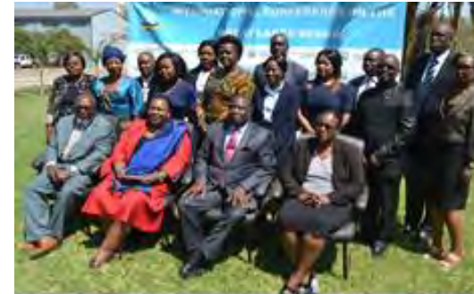
Group photo: Participants at the Workshop on the Implementation of Laws and Policies on SGBV in Zambia, 6 th September 2017.