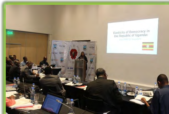
Participants listening to a presentation during workshop on Elasticity of Democracy

Forced Displacement and Border Communities Project.