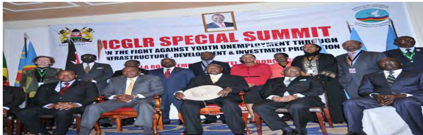
Photo: Group photo of the Heads of State and Government during the Special Summit on 24 July 2014,

The findings of the study on Youth Unemployment was the basis for holding the ICGLR Special Summit of Heads of State and Government in July, 2014, Nairobi, Kenya, whose output was the adoption of the Declaration on 'the Fight against Youth Unemployment through Infrastructure Development and Investment Promotion.