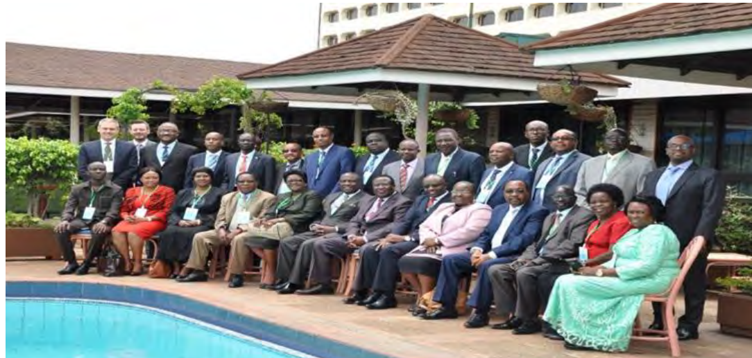
Participants at the Workshop with the Guest of Honour , Hon. Ekwee Ethuro, Speaker of the Senate of Kenya

3.2. Organised and Facilitated the Capacity Building Workshop for ICGLR Member States Parliamentarians on “Strengthening Oversight on Policy Frameworks, Fair Contracts and Revenue Transparency in Natural Resource Governance”, in Nairobi, Kenya, 27 th - 28 th April, 2016.