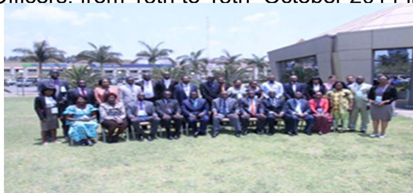
A group photo of NCs Workshop with the Guest of Honor, Hon. H. Kalaba Minister of Foreign Affairs of Zambia.

"Think Tanking" for the Great Lakes Region