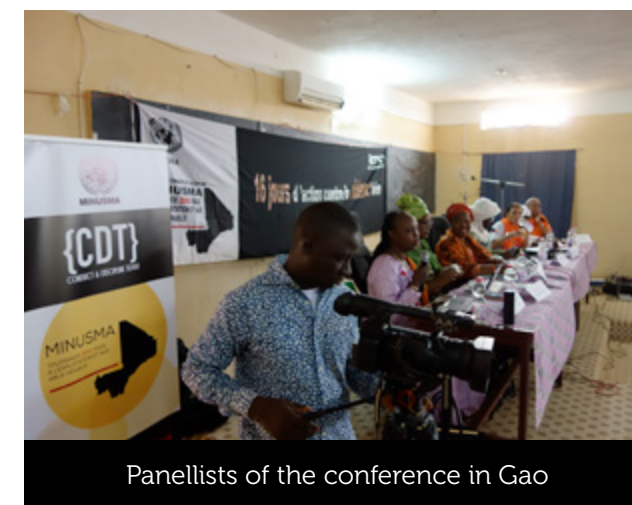
Panellists of the conference in Gao

The enthusiasm during the debates and positive feedback received from participants and panellists proved the event to be a success!