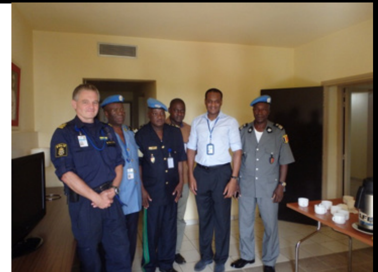
UNPOL CDT Focal points and CDT trainers

CDT organized an intensive training on 10 and 11 September 2014 at Hotel El Farouk in Bamako for UNPOL designated to be CDT Focal Points for the regions of Kidal, Timbuktu, Gao and Bamako. The Focal Points are trained to be advisors, trainers and coordinators. Under CDT’s guidance, the Focal Points will raise awareness among all MINUSMA personnel on obligations and responsibilities on Sexual Exploitation and Abuse (SEA) by organizing training / workshops.