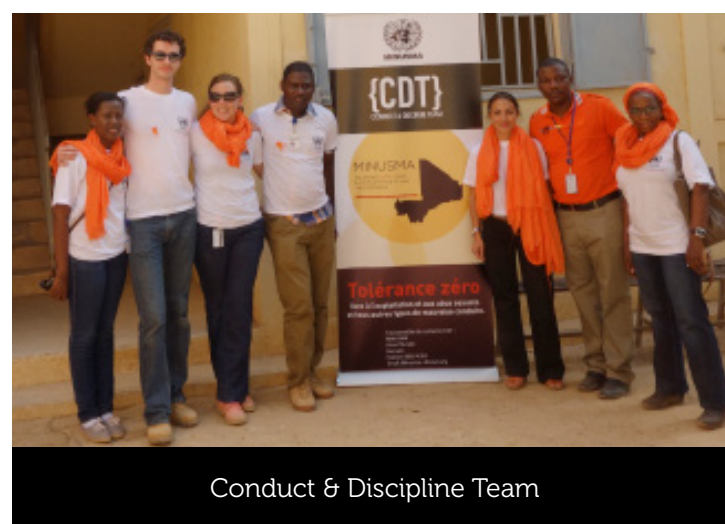
Conduct & Discipline Team