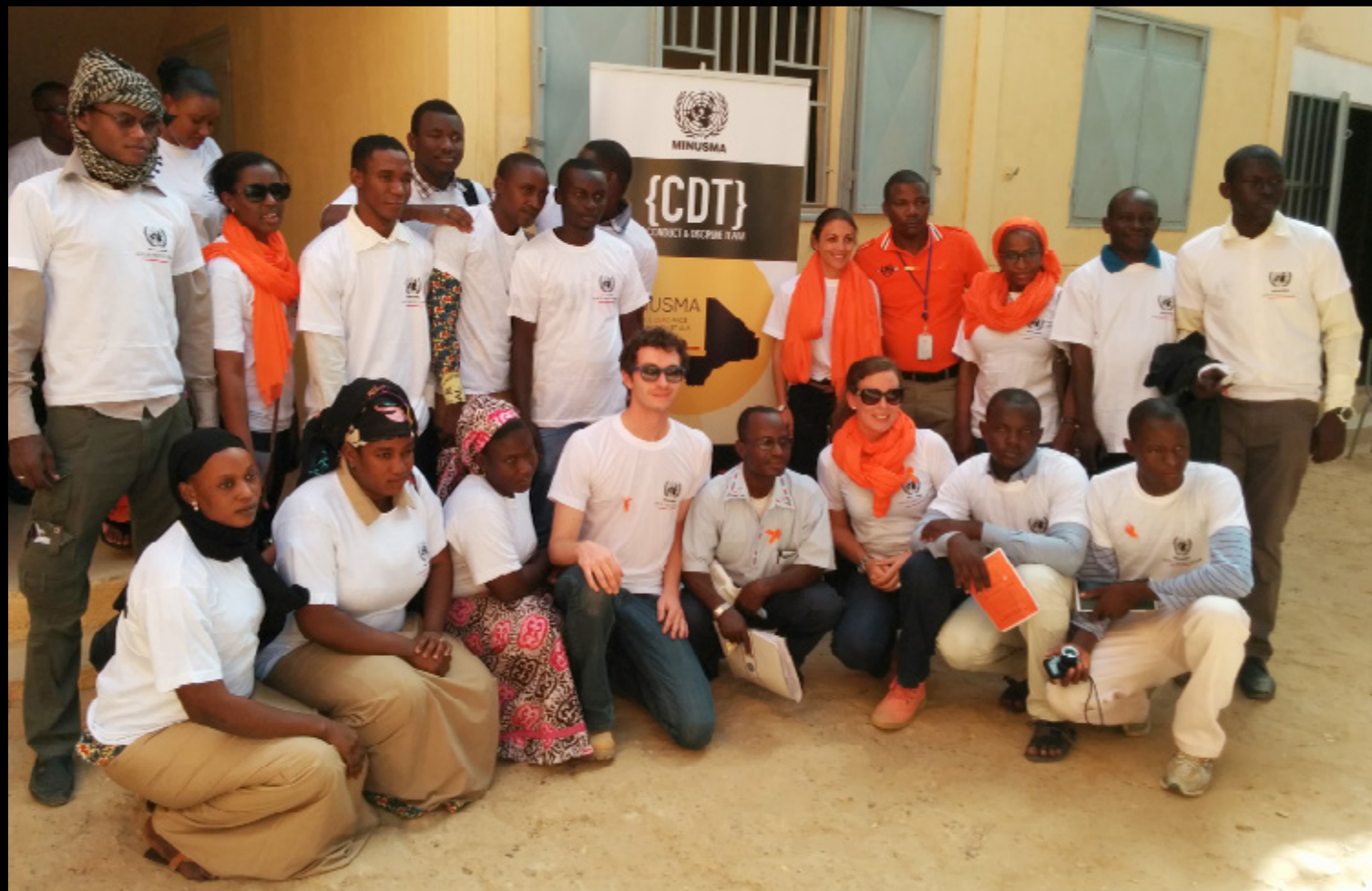
CDT and its local trainers whom were instrumental in the organization of the conference