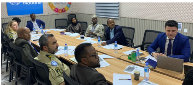
JRoLP TC Meeting in progress in 'Somaliland'

On 5 February, UNTMIS Police participated in the Joint Rule of Law Programme (JRoLP) Technical Committee Meeting in Hargeisa, uniting with key partners including UNDP, UNODC, UN Women, the "Somaliland" Human Rights Commission, and the EU Delegation. The collaborative session focused on a comprehensive review of the JRoLP's achievements in 2024 and the formulation of strategic priorities for the current year. The Annual Work Plan was approved, paving the way for continued progress. In 2025, UNTMIS Police will continue to support initiatives to strengthen crime prevention, effective public event management, and essential human rights training for the "Somaliland" Police. These focused efforts are integral to strengthening law enforcement capabilities and bolstering the overall justice system in "Somaliland."