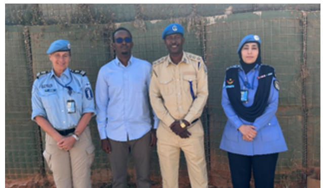
SPC Team with Jubaland Ministry of Internal Security and Jubaland State Police officials

From 12 January to 6 March, the Standing Police Capacity (SPC) Team from Brindisi, Italy, in collaboration with UNTMIS Police and UNDP, conducted a community policing baseline assessment across Somalia's Federal Member States. The assessment, aimed at supporting the implementation of the Joint Police Program Phase II (JPP-II), examined existing community policing practices, structures, and challenges within the Somali Police at the state level. Through engagements with ministry and police leadership, community representatives, and key stakeholders, the SPC team gathered insights to inform future interventions.