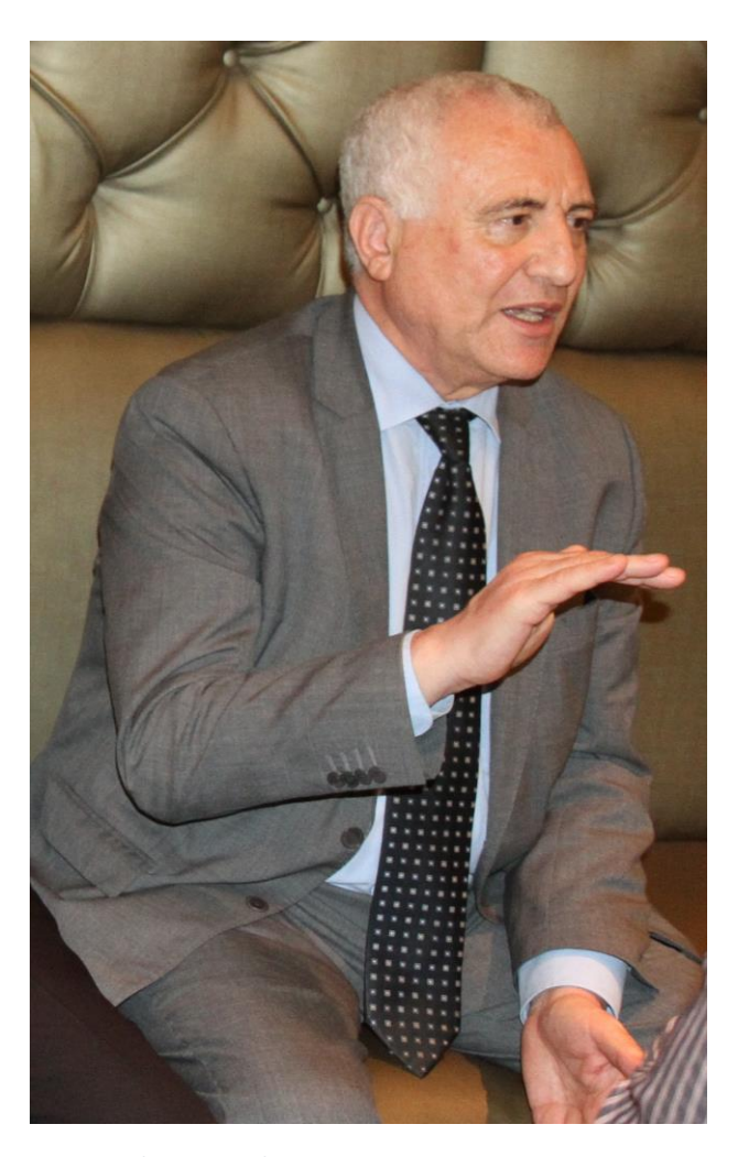
UN Special Envoy Said Djinnit

Implementation of national and regional commitments under the PSC Framework: